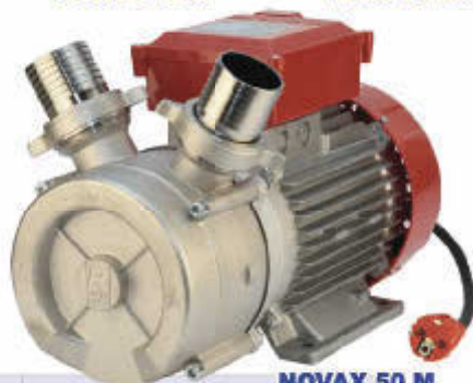
NOVAX 50 M