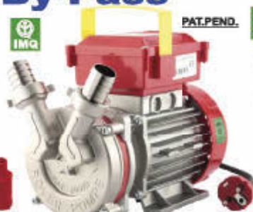
NOVAX 25 M