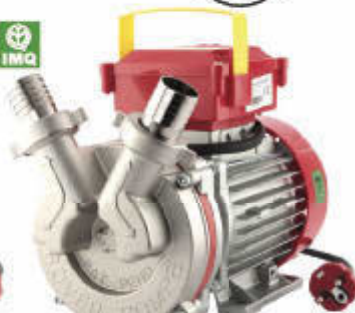
NOVAX 30 M