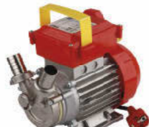
NOVAX 25 M By-Pass

COMUTATORE ROCKER SWITCH IN INTERRUPTOR PULSADOR DRUCKKNOPFSCHALTER