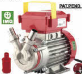
NOVAX 20 M