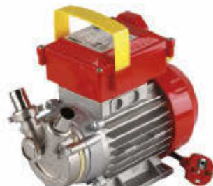
NOVAX 20 M By-Pass