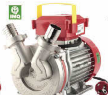
NOVAX 40 M